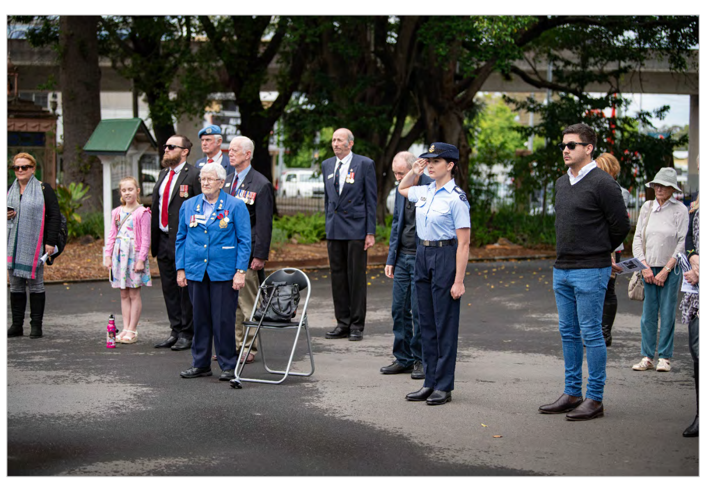
Playing of the Last Post