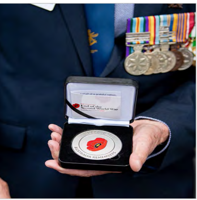
WWII Commemoration Medallion

This event was conducted under a rigorous COVID-19 plan.